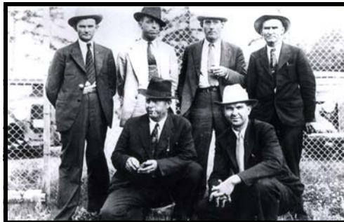
The six Officers of the Ambush

The Authentic Bonnie and Clyde Museum will be open Friday and Saturday all day with free admission. The official festival t-shirts will be sold in the museum for $10.00 each ($12.00 for sizes XXL and larger) along with various other souvenirs. Gibsland Bank and Trust's booth will also be selling the official festival shirts. Proceeds from these official festival shirts and souvenirs are what provide this wonderful festival for everyone to attend, so please be sure and purchase your souvenir items to help with expenses for our festival!! Read about Bonnie and Clyde in historical newspaper articles and see a large exhibit of photographs and memorabilia of the couple at the "Authentic Bonnie and Clyde Museum". The museum also has historical pictures of the town and local artifacts. Plan to take a part of Bonnie and Clyde history home with you by purchasing Bonnie and Clyde souvenirs, ranging from newsprint history or a book with copies of historical newspaper articles to postcards with pictures of the couple. The museum will be something you will not want to miss!