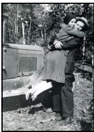
Blanche and Buck Barrow