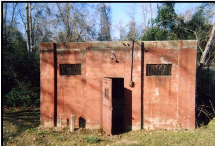
Old Gibsland Town Jail - Will soon be open to the Public (Circa 1920) Clyde and Bonnie would have made note of this as they passed by it on several occasions.

the meeting and has lined up several speakers for the much-anticipated event. Everyone is invited to attend this meeting so please come and join us for an interesting and informative night. This will be one of the highlights of the festival that you will not want to miss!