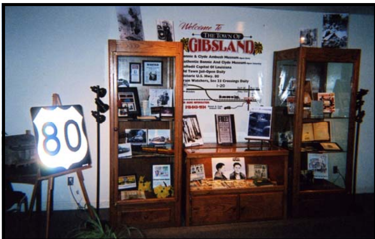
The I-20 Tourist Information Center on the east bound entrance to Louisiana has a new exhibit that tells the story of Bonnie & Clyde and Gibsland.

The Town of Gibsland, created in 1883 with the coming of the railroad, recaptures the 1930's with events for the Bonnie and Clyde Festival that remind one of a long-ago day when it was a thriving village of several thousand inhabitants who were there and saw the passing of Bonnie and Clyde, who killed and robbed during the early 1930's.